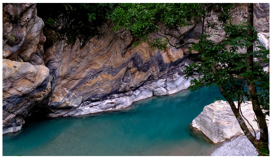
Overnight: Buluowan Hotel, Taroko National Park

Wake up to the sound of the sea and, after breakfast, we will drive in Taroko National Park where you can admire the most beautiful marble landscape in the world. Walk around this impressive site and enjoy all the attractions in front of you.