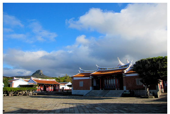
Overnight: Kenting Youth Activity Centre