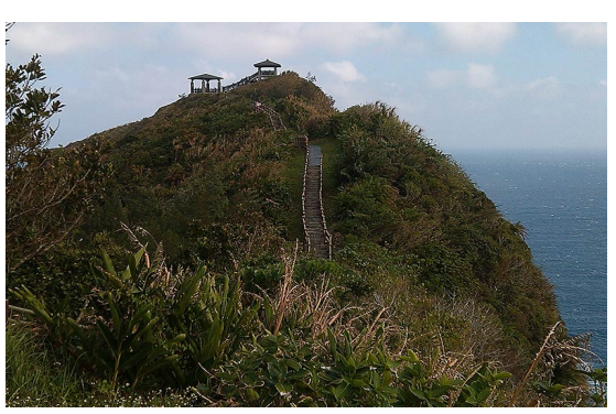
Overnight: Lüdao / Green Island